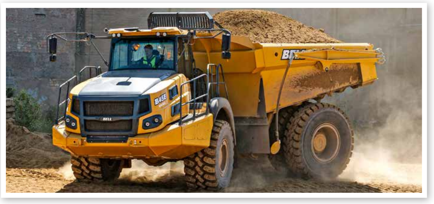
The B45E 4x4 has successfully brought the conceptual advantages of Bell Equipment's two-axle ADT to the 40-tonne payload class.

For today's quarry operations, with lower maximum speeds and shorter hauls, Bell 4x4s offer a more economical drive concept compared to 4x2 rigid trucks that are designed for high top speeds over long distances. "The lower fuel consumption has a direct effect on the operational costs.