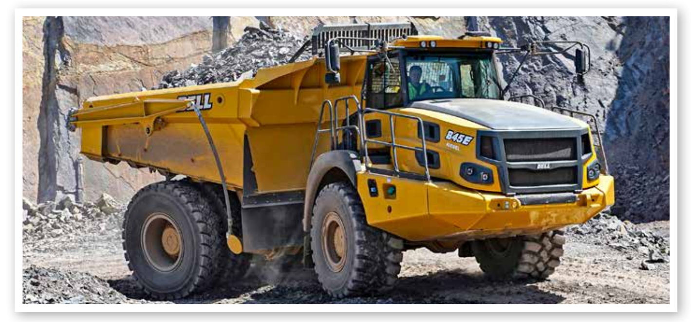
The 25m<sup>3</sup> rock bin of the Bell B45E 4x4 offers a low tipping height at crusher housings or in underground applications.

In designing the rear chassis and the 25m<sup>3</sup> bin, the company followed the design of the Bell 4x4 flagship, the B60E which has been optimized for tough mining applications. A rigidly mounted 55-t-axle supplied by German manufacturer Kessler with 21.00R35 twin tyres ensures a robust solution with a nominal payload of 41 tonnes. At the front the truck rolls on 775/65R29 tyres that boast high load carrying capacities and high lateral stability, an essential characteristic for a machine