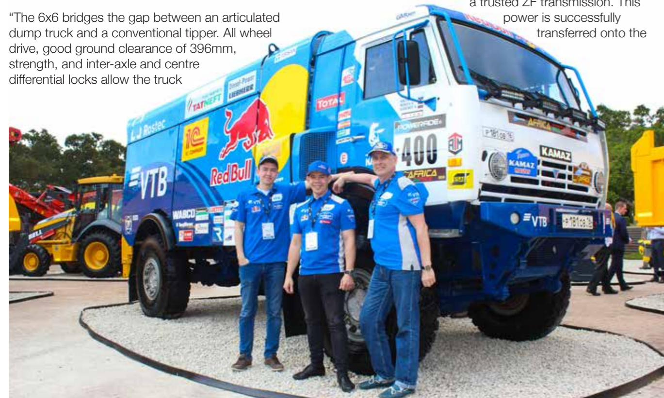
The Kamaz racing truck was a huge attraction with members of the Kamaz Master team on hand to answer questions.

The three larger trucks are equipped with proven 400hp (294kW) Kamaz-built engines that supply power through a trusted ZF transmission. This power is successfully transferred onto the