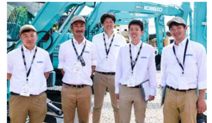
Kobelco was well represented at bauma CONEXPO AFRICA providing support to the Bell team.

Bell Equipment and Kobelco celebrated their new partnership at bauma CONEXPO AFRICA 2018 by performing the customary Japanese kagami-biraki, or barrel breaking ceremony, to represent harmony and good fortune.