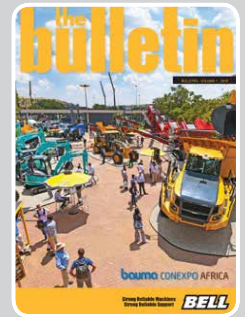
Cover picture: Bell Equipment made a huge impact in March at bauma CONEXPO AFRICA... read more on page 4.

Published by the Marketing team for Bell Equipment customers and friends worldwide.