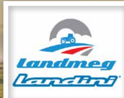
Landmeg Landini Cradock Eastern Cape