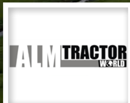
ALM Tractor World Sasolburg Free State