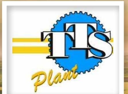
Truck and Tractor Specialists Polokwane Limpopo