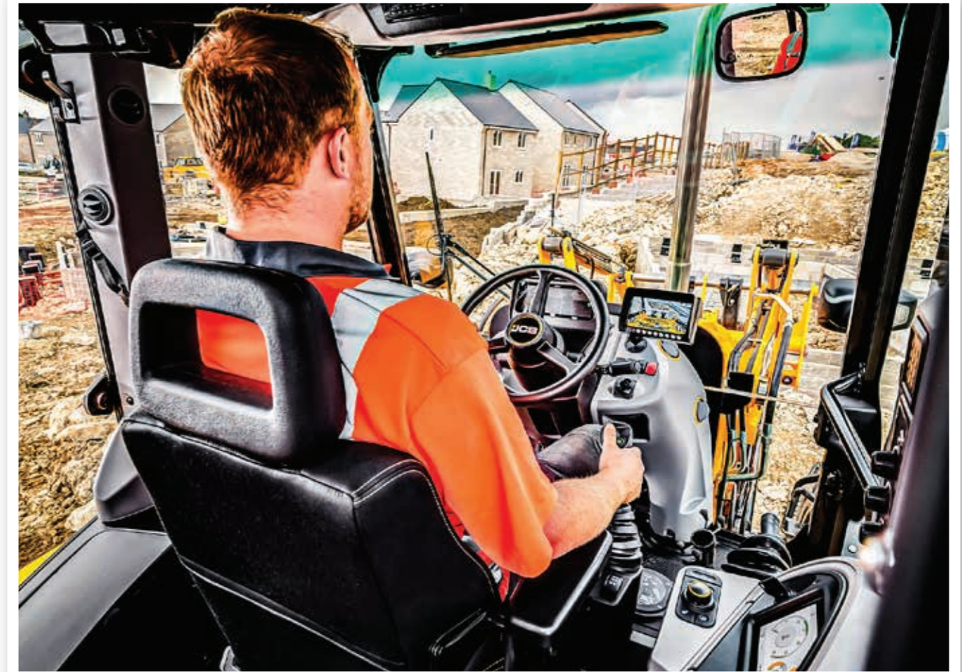
The spacious interior of the new JCB 3CX Pro places a huge focus on operator safety, comfort, and ease of operation.

In addition, the 3CX Plus model features a new high performance HVAC air conditioning system with 21 adjustable air vents strategically positioned around the front console, 'B' pillar and rear of the machine to direct air flow to maximise comfort and demisting performance. The 3CX has a fan mounted on the B pillar as standard.