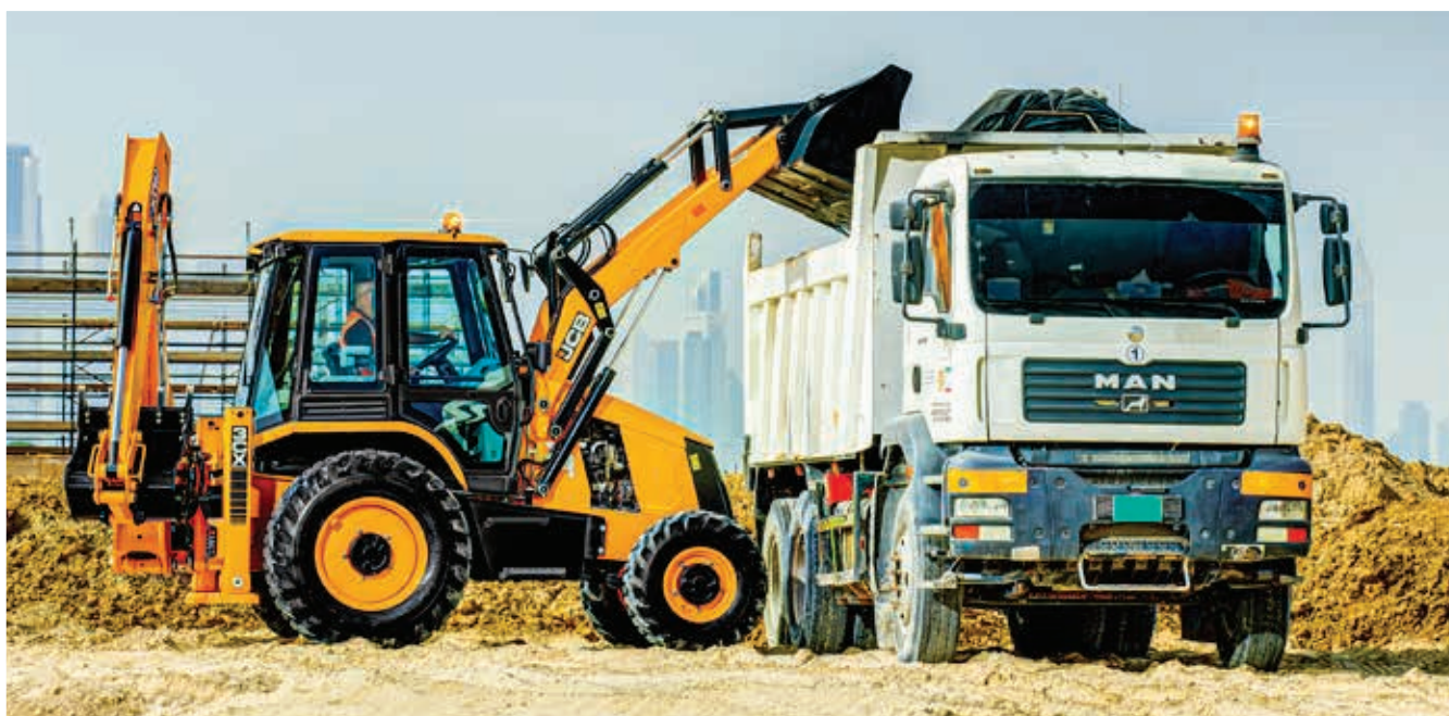
The new range of JCB 3CX Backhoe Loaders promises to build on the brand popularity with features designed to provide improved comfort, versatility, and productivity.