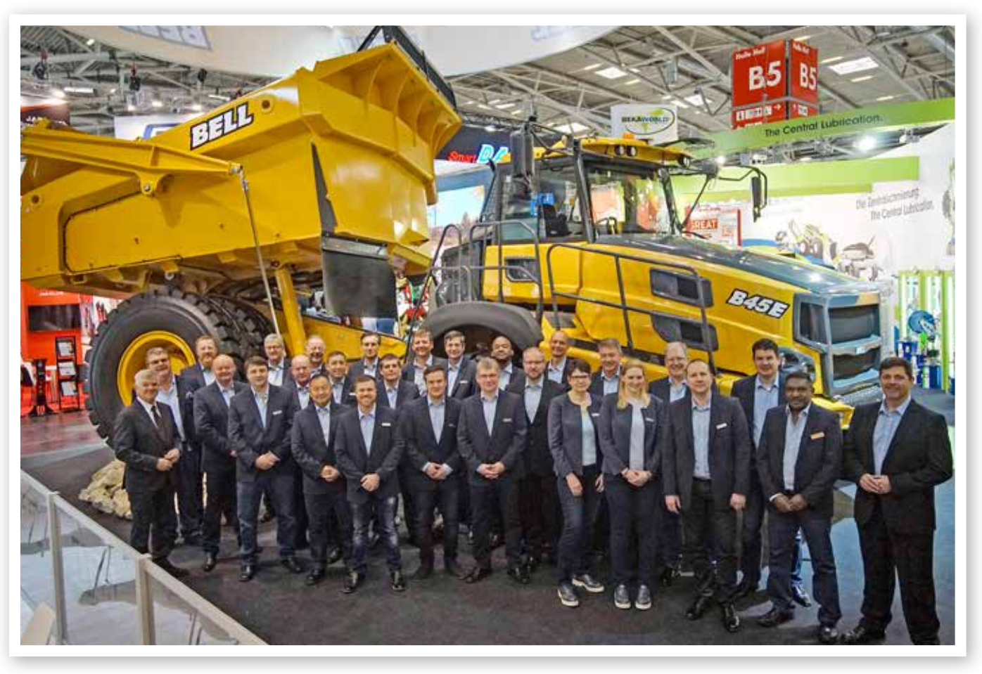
Our multi-national experts from Bell Equipment's sales and technical departments provided competent customer support during the seven busy Bauma days.

The Bell Bauma stand gave an impressive snapshot of our comprehensive ADT range offered to all global segments of earthmoving, quarrying and mining.