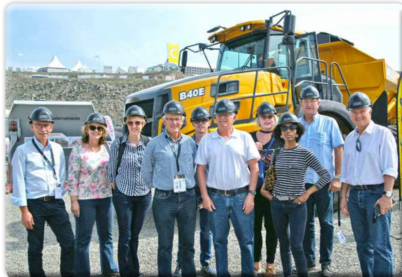
Members of Bell Equipment's Board of Directors visited Steinexpo on the occasion of the opening of the company's new European Logistics Centre in nearby Alsfeld.