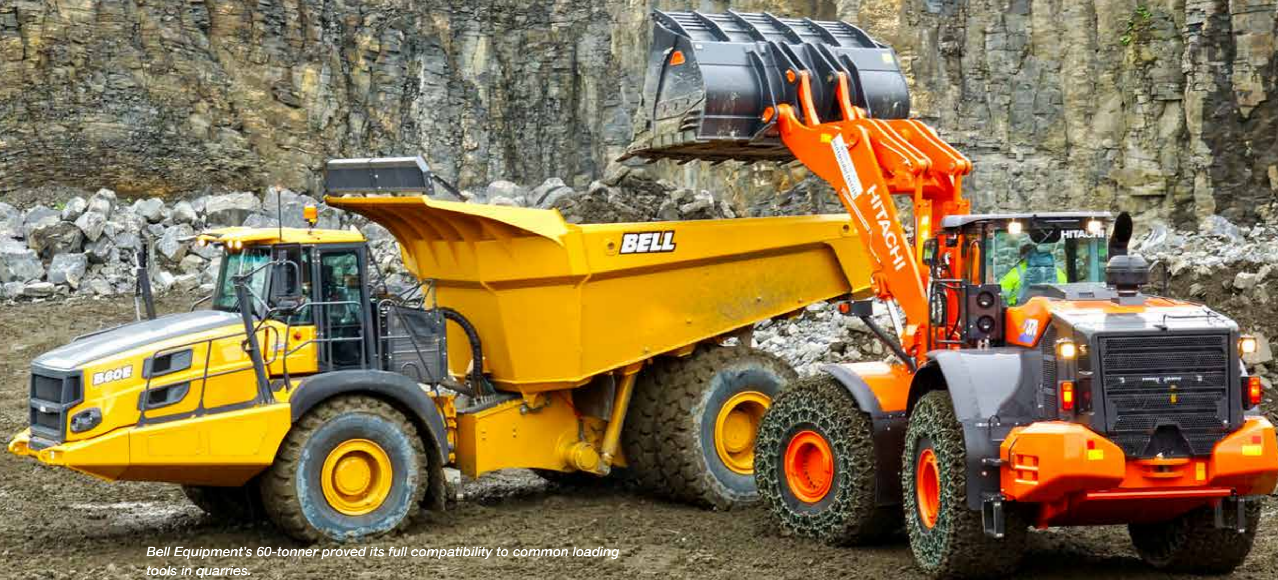
Bell Equipment's 60-tonner proved its full compatibility to common loading tools in quarries.