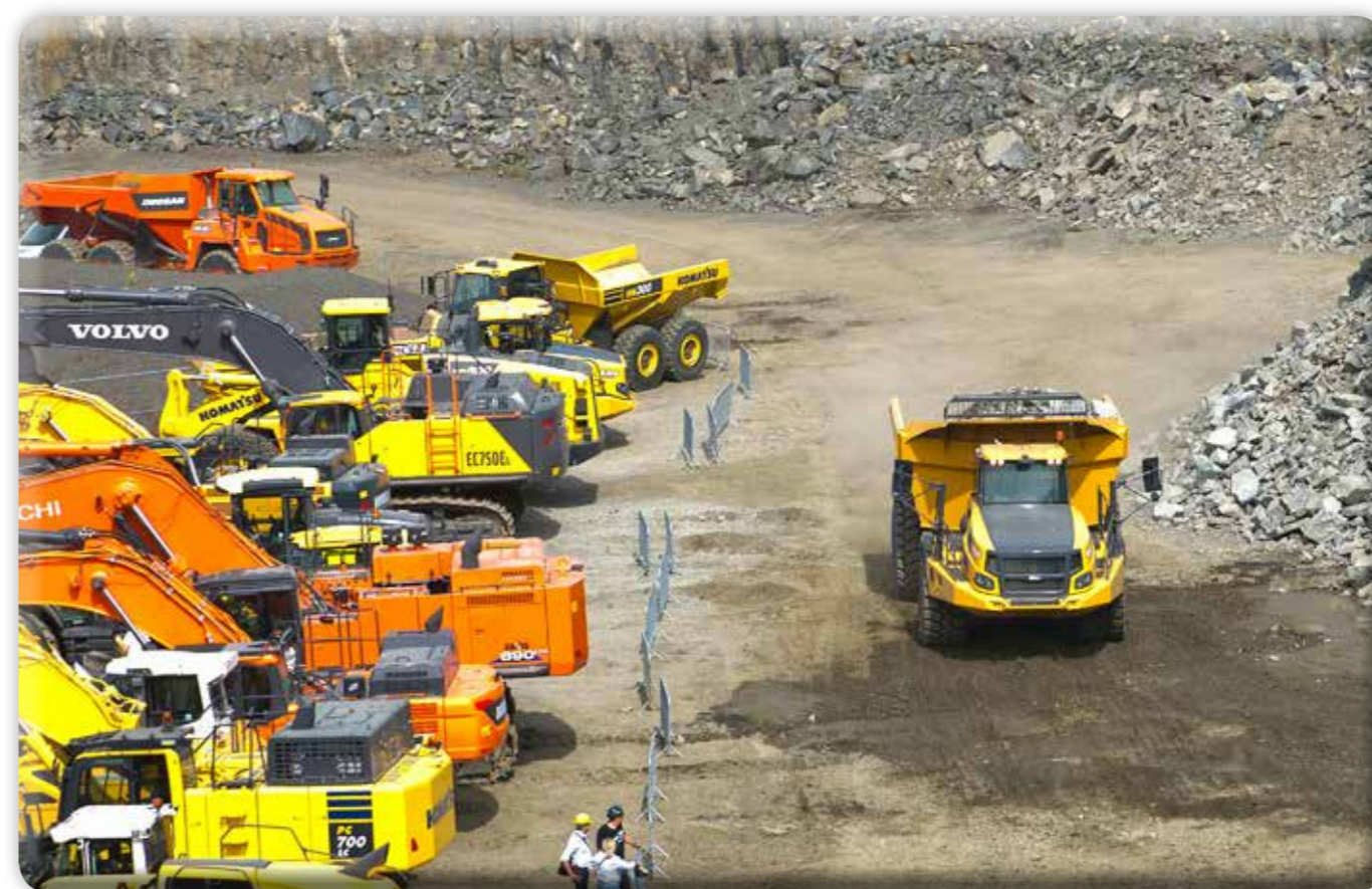
The Bell B60E was one of the highlights of Steinexpo's live demonstrations.