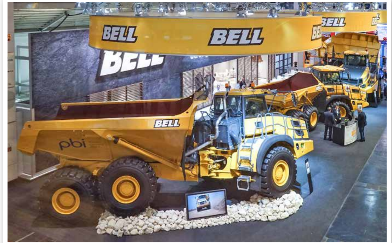
The Bell Bauma stand gave an impressive snapshot of our comprehensive ADT range offered to all global segments of earthmoving, quarrying and mining.

Exhibiting the B50E, Bell Equipment's largest 6x6 ADT, was likewise beneficial. "Customers were able to make direct stand-to-stand comparisons and recognise that Bell is still setting industry benchmarks in terms of the efficiency and safety of their