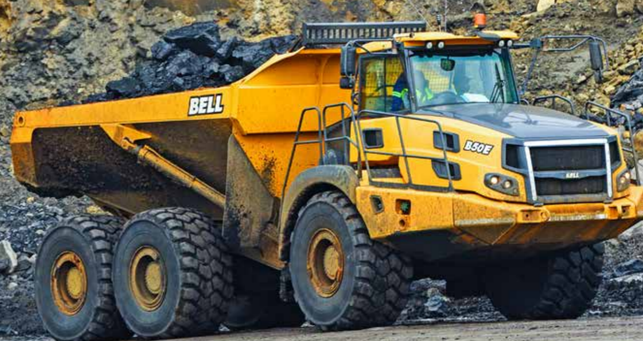
The B50E 6x6 is the company's largest 6x6 ADT and is geared for bulk earthworks and mining.