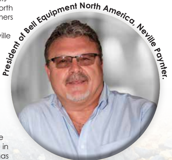
President of Bell Equipment North America, Neville Paynter.

also commenced the expansion of its factory in Eisenach-Kindel in mid-2018. Scheduled for completion in June 2019, the facility will incorporate state-of-the-art manufacturing equipment geared towards reducing operational and product costs as well as improving flexibility and supporting growth in the Northern Hemisphere markets.