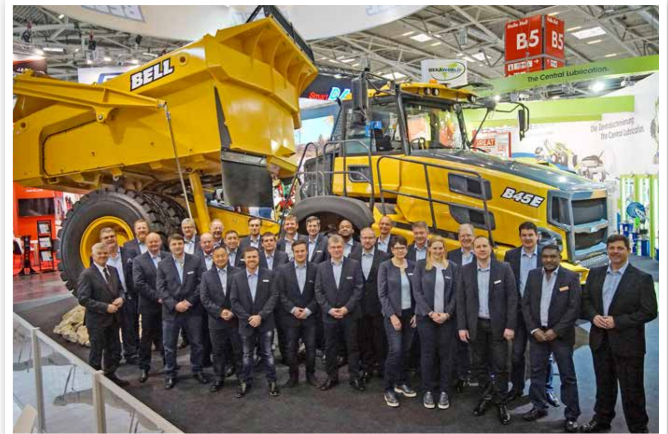
Our multi-national experts from Bell Equipment's sales and technical departments provided competent customer support during the seven busy Bauma days.